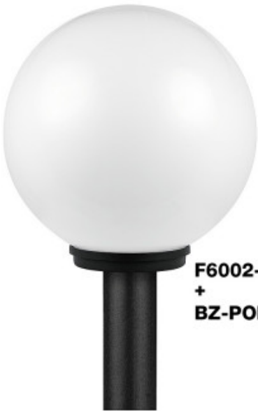
F6002-WH + BZ-POLE60