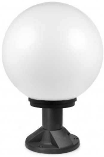
F6002-WH + FB1490