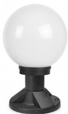
F6000-WH + FB1490