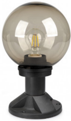
F6000-SM + FB1490