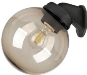
F6000-SM + FB6933-BL